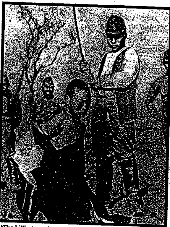
REVOLUTIONARY DOCUMENT, NANKING

Yet the Rape of Nanking remains an obscure incident. Although the death toll exceeds the immediate number of deaths from the atomic bombings of Hiroshima and Nagasaki (140,000 and 70,000 respectively, by the end of 1945) and even the total civilian casual-