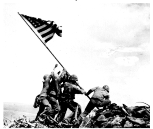
Marines raising flag at Iwo Jima February 23, 1945

In October 1944, American forces began to drive the Japanese out of the Philippines. There they found that US prisoners left behind in the 1942 defeat had been grossly mistreated by their Japanese jailers. In February 1945, US Marines landed in Iwo Jima. The US needed Iwo Jima, 750 miles from Tokyo, as a refueling airfield for bomber raids on Japan. In the bloody battle that followed, nearly all of the Japanese defenders chose to fight to the death rather than surrender; the only prisoners taken were soldiers too