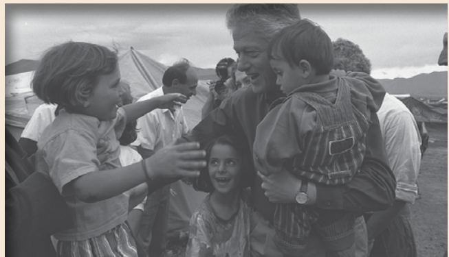
President Clinton hugs and greets Kosovar refugee children and families at Stenkovic 1 Refugee Camp near Skopje, Macedonia on June 22, 1999.

History is defined by those who make decisions. The success or failure of a President's actions are always debated, and the right choices often seem unclear to decision-makers in the heat of the moment. President Clinton strongly believed that the United States should use all its resources and act in concert with its allies to stop mass violence. In the immediate aftermath of the crisis in Kosovo, Clinton traveled to the region to encourage people to seek reconciliation rather than revenge. Looking back on the conflict, many in the international community felt that Clinton's willingness to go the extra mile to end genocide, even through the use of military violence, was justified to advance the cause of peace.