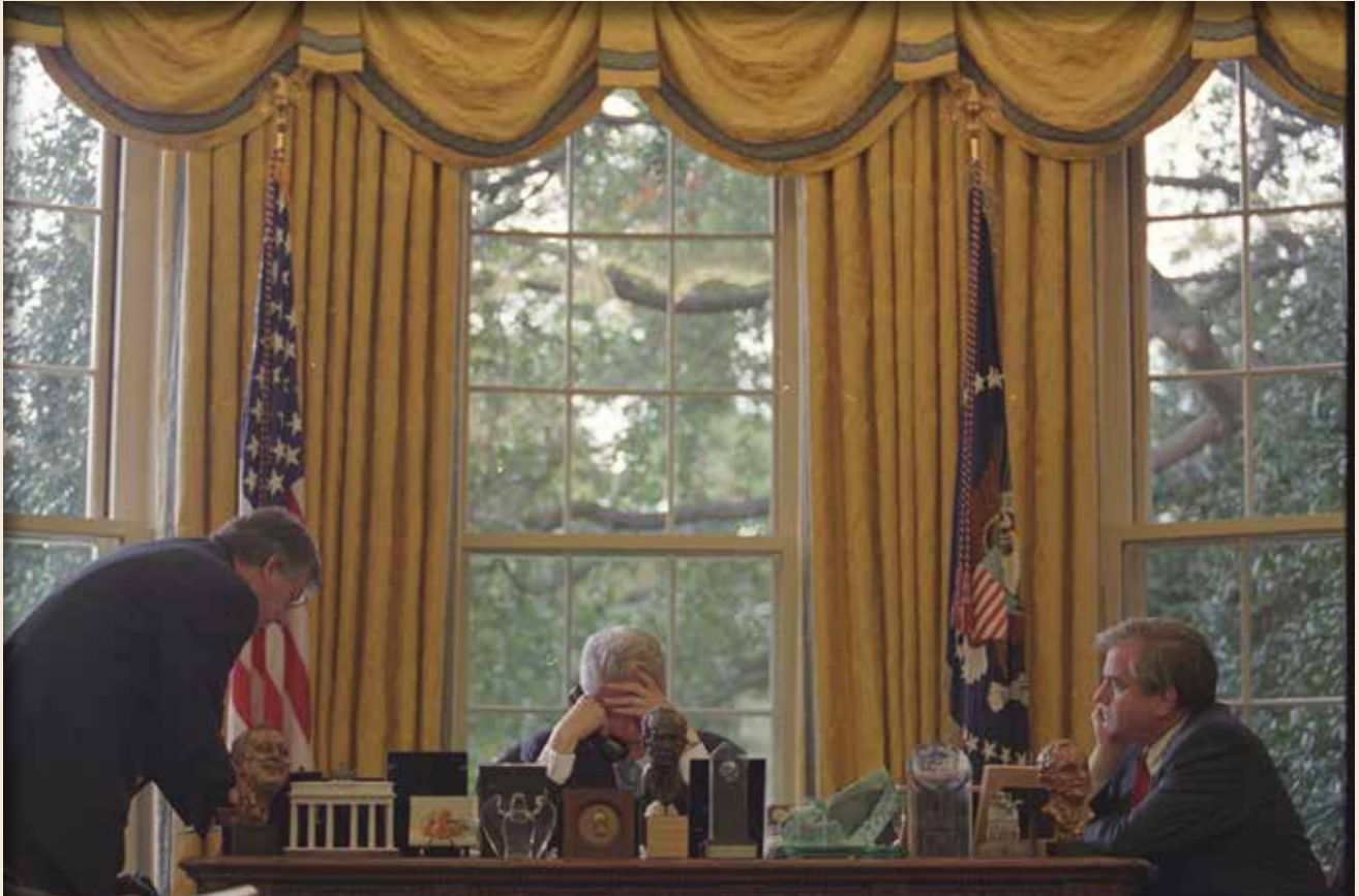
President Clinton talks on the telephone in the Oval Office separately with Prime Minister Ehud Barak of Israel and Chairman Yasser Arafat of the Palestinian Authority on October 10, 2000. Advisers Sandy Berger and Dennis Ross are present during the telephone call.