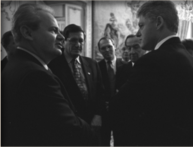
President Clinton converses with President Slobodan Milošević in Paris, France, December 14, 1995.

Serbia is the dominant political power in what remains of Yugoslavia. In 1989, Slobodan Milošević came to power in Belgrade, the capital and largest city in Serbia, by promoting Serbian nationalism and supporting the grievances of Serbians throughout Yugoslavia. Most of the Serbian people are Orthodox Christians of South Slavic ethnicity, while the Kosovar people are mostly Muslim of Albanian ethnicity. Serbians in Kosovo claimed they were being mistreated by the Albanian population, and in reaction Milošević took control of the previously autonomous region of Kosovo, brought the province under direct rule from Belgrade, and fired most of the ethnic Albanian state employees, who were later replaced by Serbians.